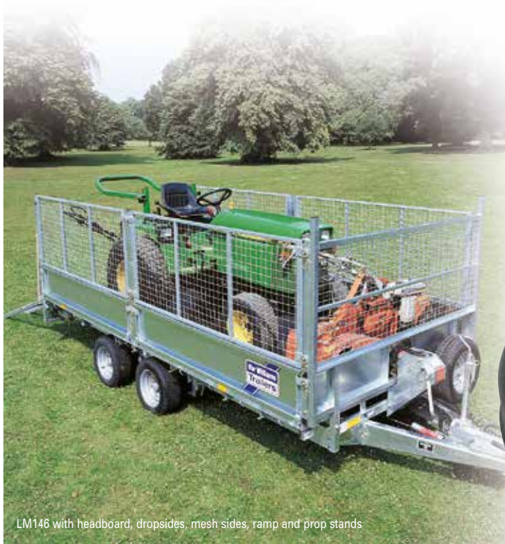
LM146 with headboard, dropsides, mesh sides, ramp and prop stands